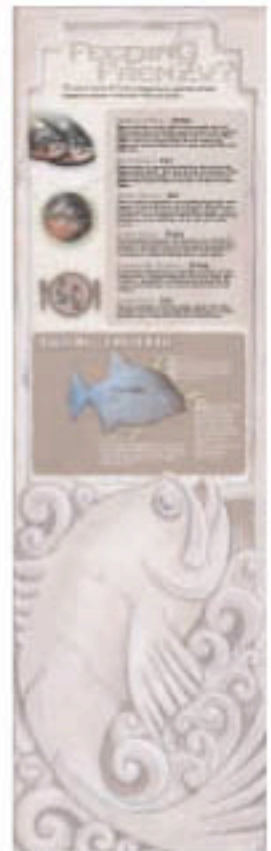
Piranha Activity Panel