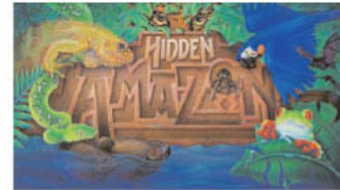
Hidden Amazon Identity was used for signage, posters and exhibit entrance portal.

Also designed and produced by Smart Graphics and Xplore Productions (an exhibit company), are various I.D. labels and large interactive informational display panels. For more information log on to www.mysticaquarium.org .