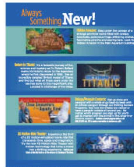
Visitor's Guide Brochure Spread