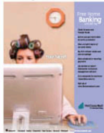
Home Banking Ad/Poster