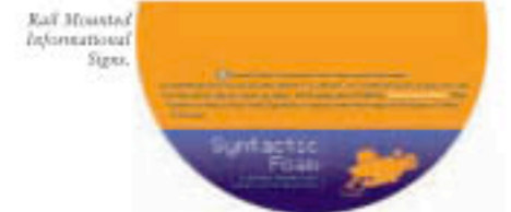
Discovery/Exploration Sign: 11' wide x 7' high

Remotely Operated Vehicles (R.O.V.) and various information. Three-dimensional rail mounted signs and posters were also some of the additional exhibits revitalized.