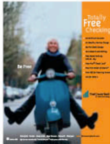
Totally Free Checking Ad/Poster

This new campaign was also designed to attract attention and deliver a strong message that's right on the mark: "It's where you belong."