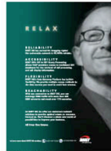
SNET DG Relax Ad