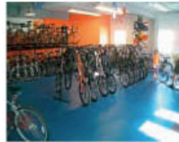
RadSport Outfitters located in Chester, CT