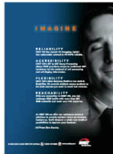
SNET DG Imagine Ad