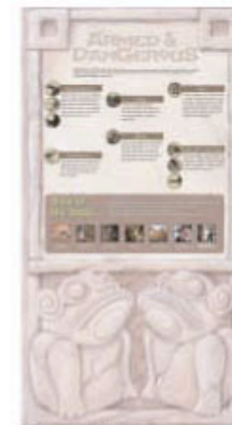
Predator Activity Panel