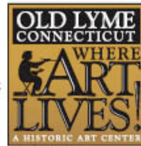
Where Art Lives Logo

Old Lyme, CT – Lyme Art Association came to Smart Graphics to promote one of New England's most captivating places - Old Lyme, CT. As the town Where Art Lives, SG created an eye-catching logo that fuses the Old New England feel with the artistic talent that continues to thrive in Old Lyme today.