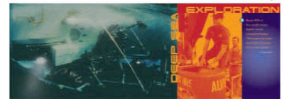
Alvin ROV Remotely Operated Vehicle Exploration Sign: 22' wide x 8' high