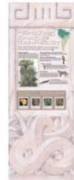
Amazing Rainforest Activity Panel