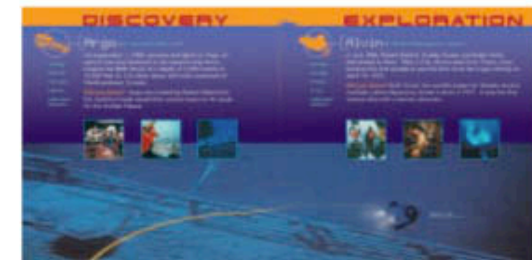
Discovery/Exploration Sign: 11' wide x 7' high