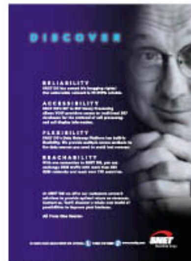
SNET DG Discover Ad

Meriden, CT – SNET Diversified Group requested Smart Graphics for the fifth year in a row to handle their advertising campaign. Proudly, SG met the challenge and captivated SNET DG's audience with up-close, black & white photos and inviting one-word headlines. Shifting the campaign mood from humorous to serious, SNET demonstrates just how focused they are about quality service.