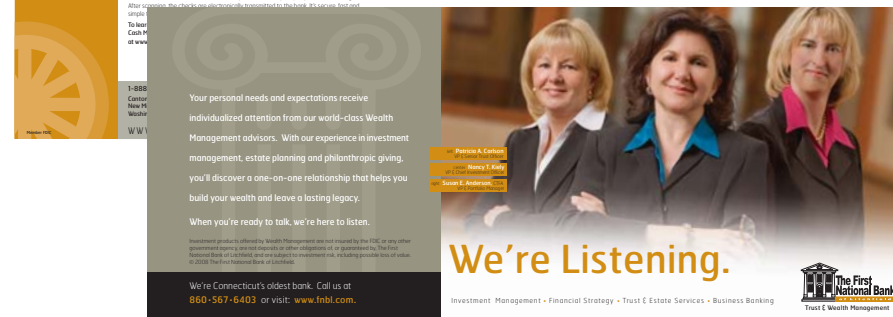
TFNBL Horizontal Newspaper Ad