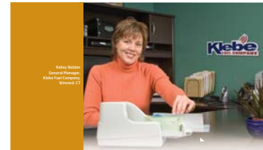
TFNBL Vertical Newspaper Ad

Brookfield, CT, Marketing Resources teamed up with Smart Graphics to help create a new campaign for The First National Bank of Litchfield. This campaign called for a redesign of an existing campaign by using their graphic elements and color palette to create a new look for all their markets. The billboards and ads consisted of art directed custom photography of bank customers endorsing the bank's products and services.