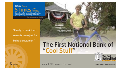
TFNBL Oversized Postcard