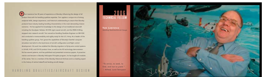
Technical Fellows Spread Page