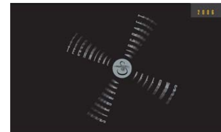
Technical Fellows Brochure Cover

book. The book recognizes top individuals who have demonstrated outstanding achievements in their area of expertise.